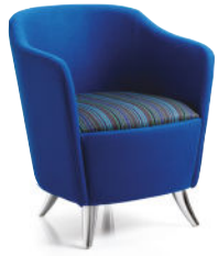
SL1 Compact Tub Chair (shown with polished chrome legs)