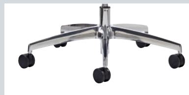
B7 Aluminium 5 Star base with black nylon castors