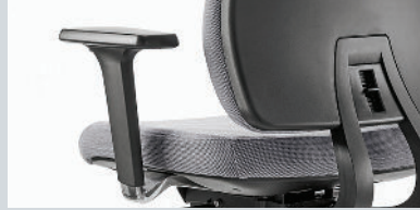
AZA Height and front/back adjustable arm with black soft feel topper and aluminium bracket