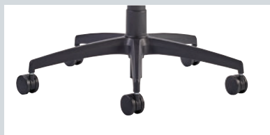
B6 Black 5 Star PA base as standard with black nylon castors