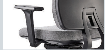
AZB Height and front/back adjustable arm with black soft feel topper and black bracket