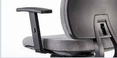
AB Black height adjustable arm with soft feel topper