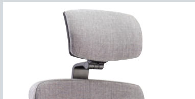
HRUP Upholstered chair fully adjustable headrest