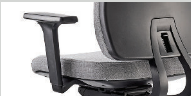
AZB Height and front/back adjustable arm with black soft feel topper and black bracket