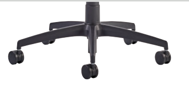
B6 Black 5 Star PA base as standard with black nylon castors