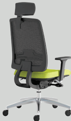
ABM1 Mesh back with integral lumbar