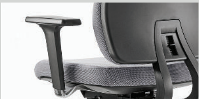
AZA Height and front/back adjustable arm with black soft feel topper and aluminium bracket