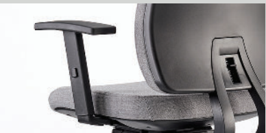
AB Black height adjustable arm with soft feel topper