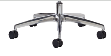
B7 Aluminium 5 Star base with black nylon castors