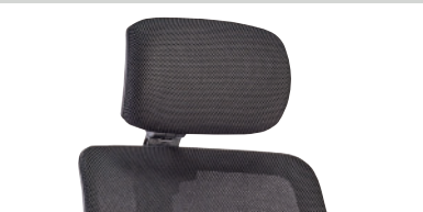
HRMESH* Mesh chair fully adjustable headrest

*It is possible to have upholstered fabric on a mesh chair headrest