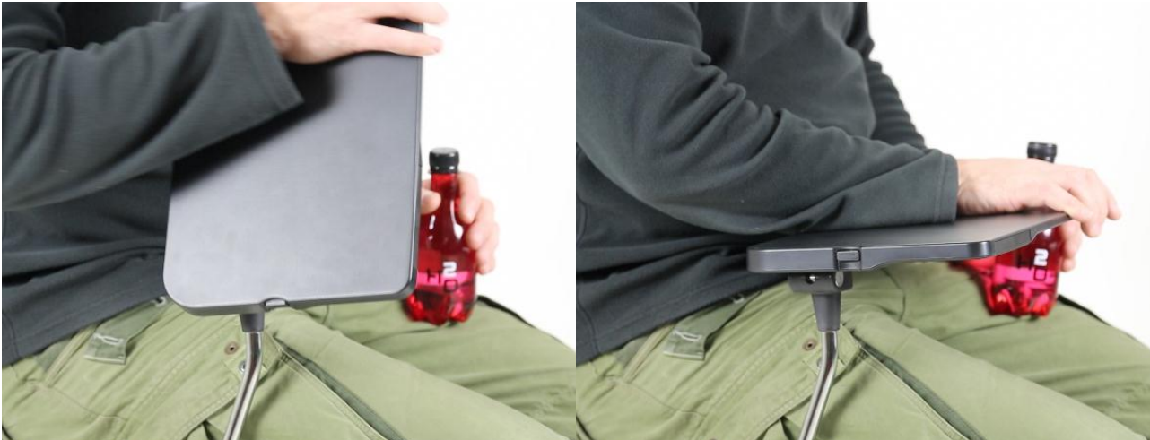
The tablet can be folded away