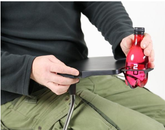
The tablet has an integrated cup holder