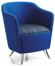
SL1 Compact Tub Chair (shown with polished chrome legs)