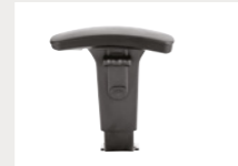
ARM AU Black Height Adjustable