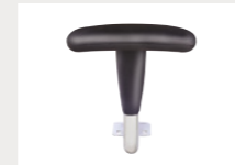
ARM AD Chrome Height Adjustable