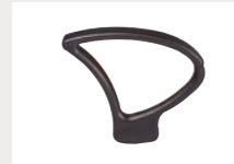
ARM AR Black Low Leading Edge Fixed