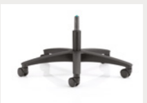
BASE B9 27" Black Nylon Base (standard on Airo and Fresh)