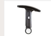
ARM AM Black Height Adjustable & Retractable