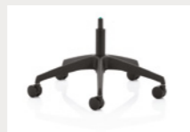
BASE B2 Black Nylon Spider Base