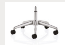
BASE B5 Aluminium Spider Base