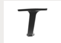
ARM AT Black Height Adjustable