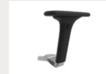
ARM AV Height Adjustable Back Forward Twist