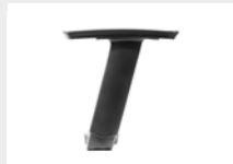
ARM AN Black Height Adjustable