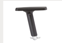
ARM AJ/A Soft Pad with Forward and Back Movement - Aluminium