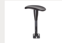
ARM AS Black Swivel with Soft Feel Kidney Pad