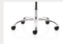
BASE B3 Chrome Base with Chrome Gas Lift