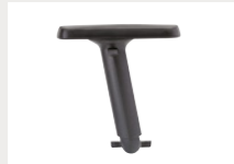
ARM AJ/B Soft Pad with Forward and Back Movement - Black