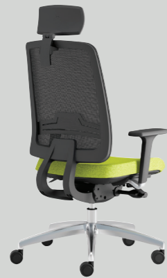
ABM1 Mesh back with integral lumbar