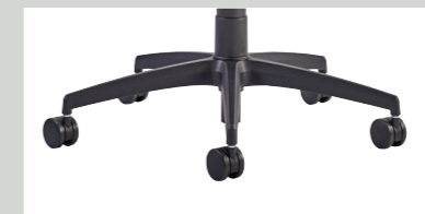
B6 Black 5 Star PA base as standard with black nylon castors