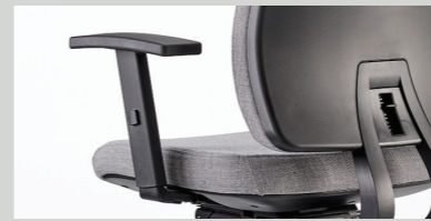
AB Black height adjustable arm with soft feel topper