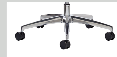
B7 Aluminium 5 Star base with black nylon castors