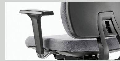
AZA Height and front/back adjustable arm with black soft feel topper and aluminium bracket