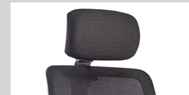
HRMESH* Mesh chair fully adjustable headrest

*It is possible to have upholstered fabric on a mesh chair headrest