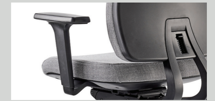
AZB Height and front/back adjustable arm with black soft feel topper and black bracket