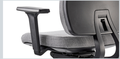
AZB Height and front/back adjustable arm with black soft feel topper and black bracket