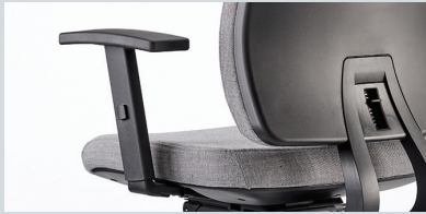
AB Black height adjustable arm with soft feel topper