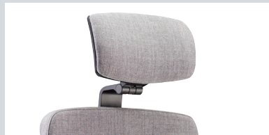
HRUP Upholstered chair fully adjustable headrest